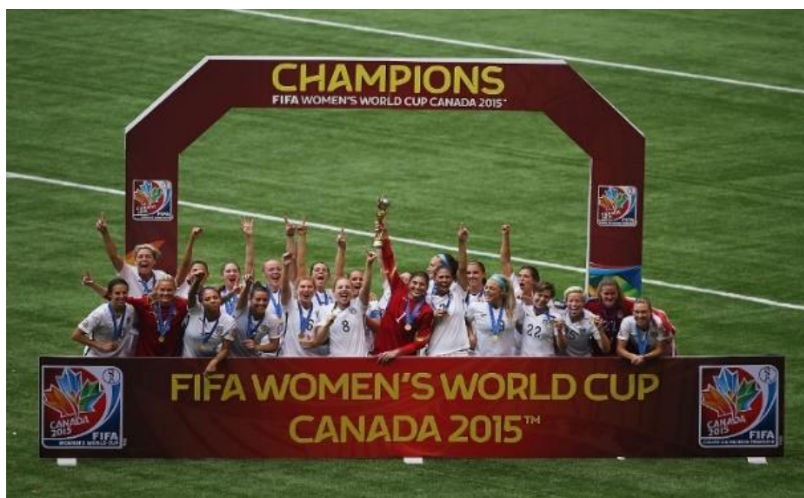
USA players celebrate after winning the 2015 final against Japan in Vancouver, Canada.