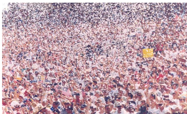
A record 90,185 spectators turned up to the Rose Bowl in Los Angeles on 10 July 1999 to witness the USA pull off a breathtaking 5-4 penalty shoot-out victory over China PR in the final.