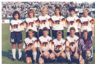
Germany, back row from left to right: Petra Damm, Heidi Mohr, Doris Fitschen, Gudrun Gottschlich, Bettina Wiegmann, Silvia Neid; front row: Martina Voss, Birgit Austermuehl, Britta Unsleber, Jutta Nardenbach, Marion Isbert