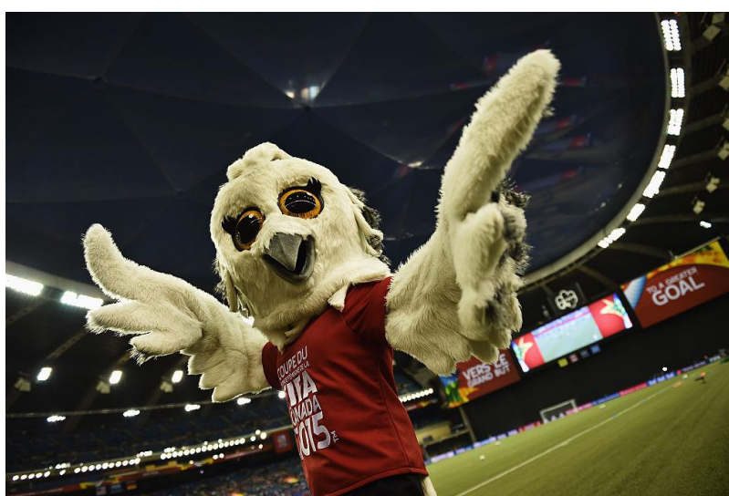
Shuême, the Official Mascot of the FIFA Women's World Cup 2015™, poses during the semi-final between the USA and Germany at the Olympic Stadium in Montreal, Canada, on 30 June 2015.