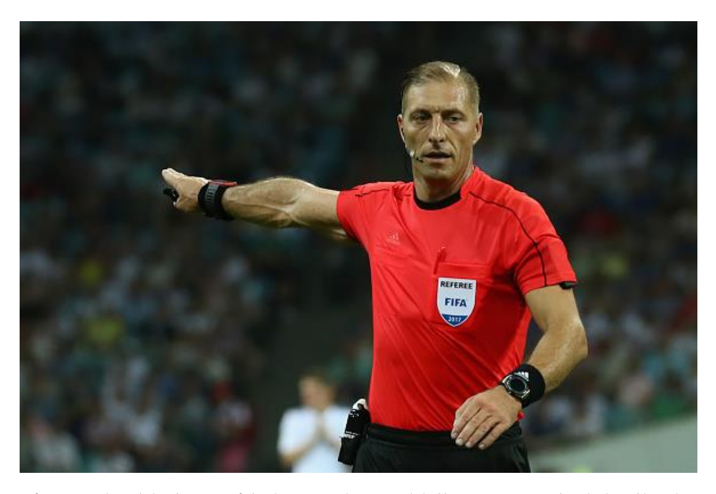
Referee Nestor Pinata during the FIFA Confederations Cup Russia 2017 Semi-Final between Germany and Mexico in Sochi, Russia.

Referee Howard Webb during the FIFA Confederations Cup Brazil 2013 semi-final match between Spain and Italy in Fortaleza, Brazil.