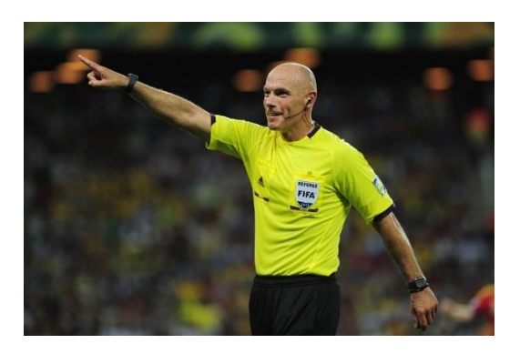
Referee Ravshan Irmatov helps Neymar of Brazil to his feet during the FIFA Confederations Cup Brazil 2013 between Italy and Brazil in Salvador, Brazil.

Referee Coffi Codjia of Benin during the FIFA Confederations Cup South Africa 2009 between New Zealand and Spain in Rustenburg, South Africa.